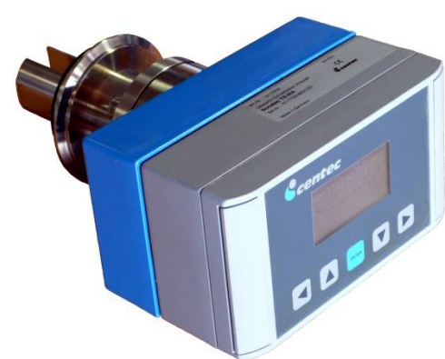
SONATEC Transmitter Version

SONATEC continuously measures the velocity of sound through liquids. Designed for applications that require maximum sensitivity and high accuracy, this device is used in various industries all around the world. Breweries and beverage manufacturers determine extract or dissolved sugar contents in-line with SONATEC. Equipped with an integrated cleaning nozzle, SONATEC HW can be installed directly into brewery wort kettles and evaporators. In numerous pharmaceutical and chemical applications SONATEC is used to control the concentration of acids, caustics and other solutions – but also for monitoring the quality of raw materials and final products. The instrument measures the speed of a sound pulse between a transmitter and a receiver. The sound pulse is created by piezo-elements and moves perpendicular to the product flow. As a specific property of each liquid, the correlation between concentration and sound velocity can be described by a mathematical polynomial. With decades of experience and own laboratory facilities, we have a particular knowledge about polynomials for a huge number of products. Any temperature drifts of the measured signal are automatically compensated for by an internal Pt1000 sensor. SONATEC displays various units, e.g. vol.%, mass %, °Brix and °Plato.