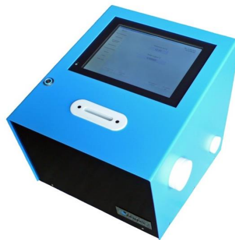
RHOTEC L Laboratory Density Meter

RHOTEC L continuously measures the density of liquids. Designed for laboratory applications that require maximum sensitivity and high accuracy, this device is ideally suited for extremely small sample volumes. For density measurement, the liquid flows through a U-shaped tube. While the tube is electronically excited to oscillate at resonance, the oscillation frequency is observed. Any change in the fluid density has an impact on the detected signal and can thus be identified. As a specific property of each liquid, the correlation between concentration and density can be described by a mathematical polynomial. With decades of experience and own laboratory facilities, we have a particular knowledge of the polynomials for a huge number of products. Any temperature drifts of the measured signal are automatically compensated for by an internal Pt1000 sensor. RHOTEC L is equipped with a very quick and accurate temperature controller based on Peltier technology. The 10" touch screen, the compatibility of the software and various interfaces for data exchange make RHOTEC L extremely user-friendly. The instrument displays various units, e.g. vol.%, mass %, °Brix and °Plato.